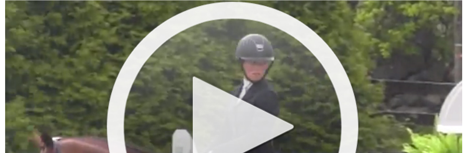
Watch how she won!