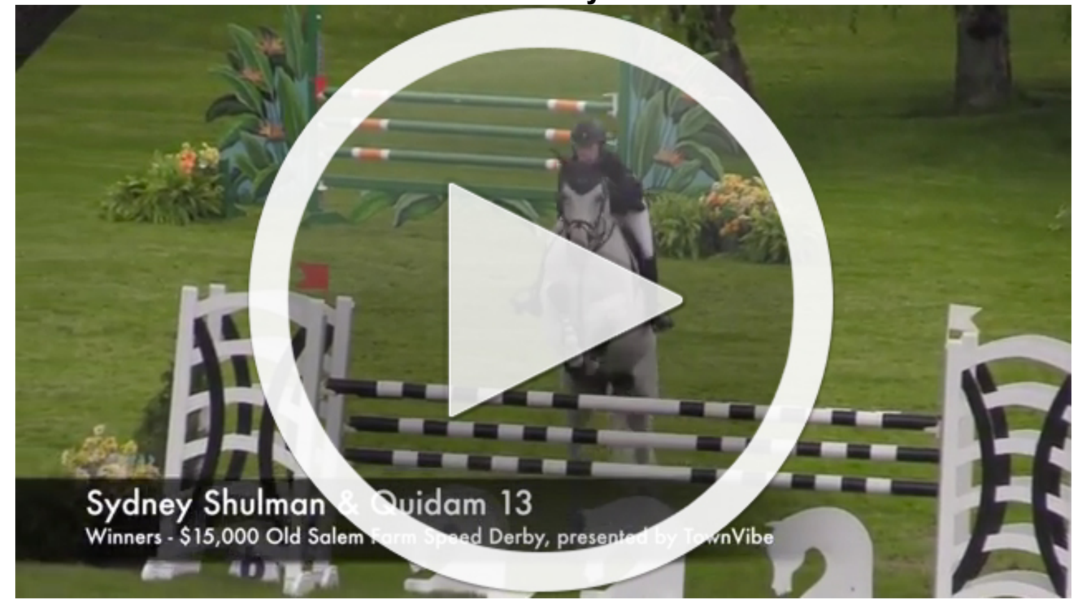
Watch how they won it!

Competition update: All Grand Prix Field competition has been moved to the Annex Ring on Sunday, May 14. The $50,000 Old Salem Farm Grand Prix, presented by The Kincade Group, will begin at 1 p.m., and will be streamed live at OldSalemFarm.net.